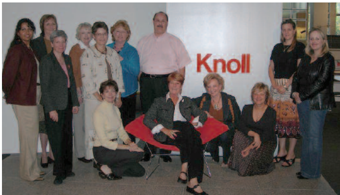
October State Board meeting at Knoll – Houston